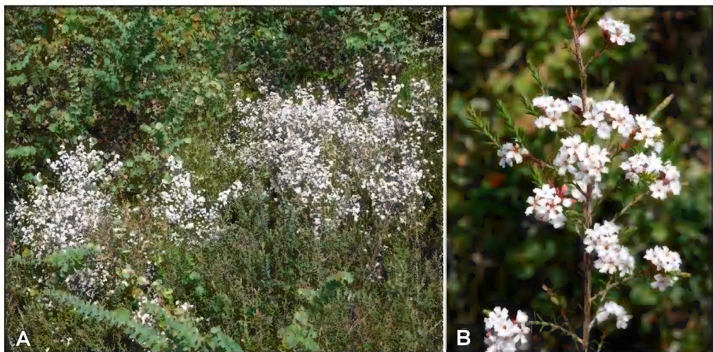
Figure 2. Leucopogon kirupensis in situ. A – plants; B – flowering branchlet. Photographs by Michael Hislop at M. Hislop 4779.